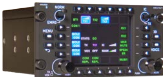
AMU6500 audio panel

Miramar (FL), USA, 5 th of October 2020.