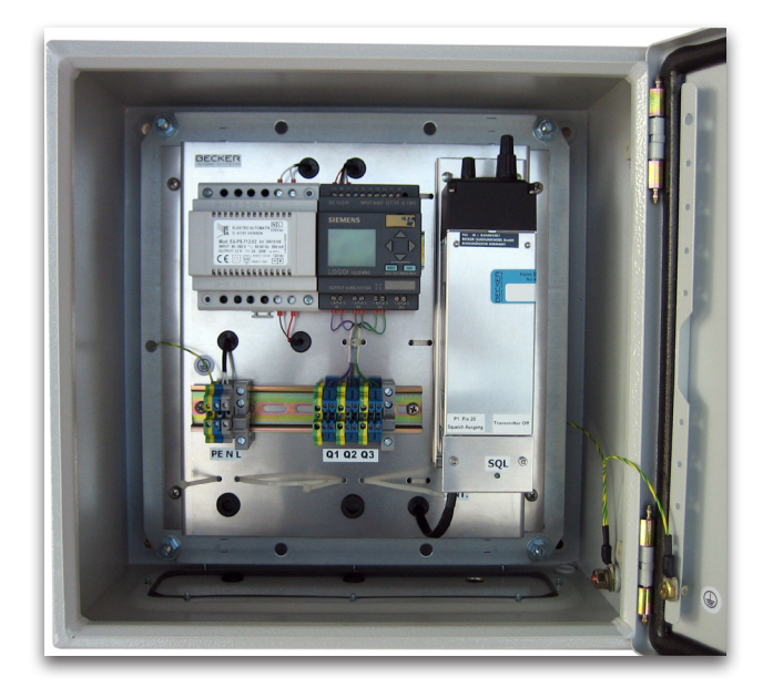
Lighting Radio Controller LRC6201